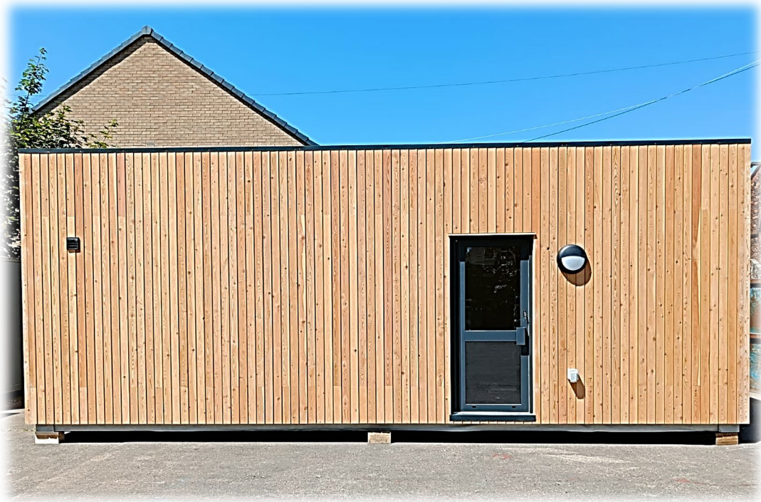
Siberian Larch cladding — a favourite for its characterful appearance.

Like all timber over time, Siberian Larch weathers to a silvery-grey, but this can be stopped and the original colour retained with a good UV treatment. The Siberian Larch cladding we stock is sorted into two grades, Grade A (unsorted I-III) and Grade B (sawfalling I-V), with the former having fewer knots than the latter.