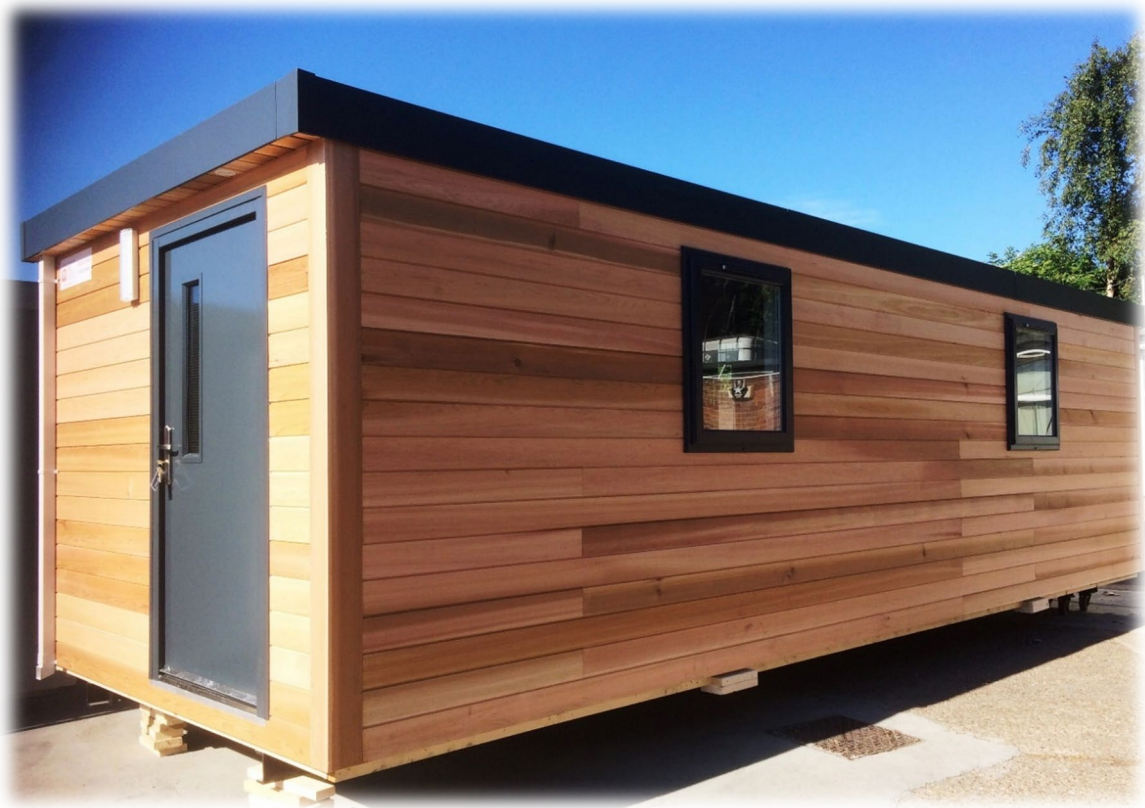
Western Red Cedar cladding — sought after for its unique reddish-brown hues.

Western Red Cedar is a beautiful, highly sought-after timber. The species comes in a variety of eye catching colours, ranging from dark chocolate brown to light pink, sometimes with a darker red streak. Grain patterns can vary to quite an extent, from close and straight to open and wild. A good cedar will be of a clear grade, which means it contains very few knots.